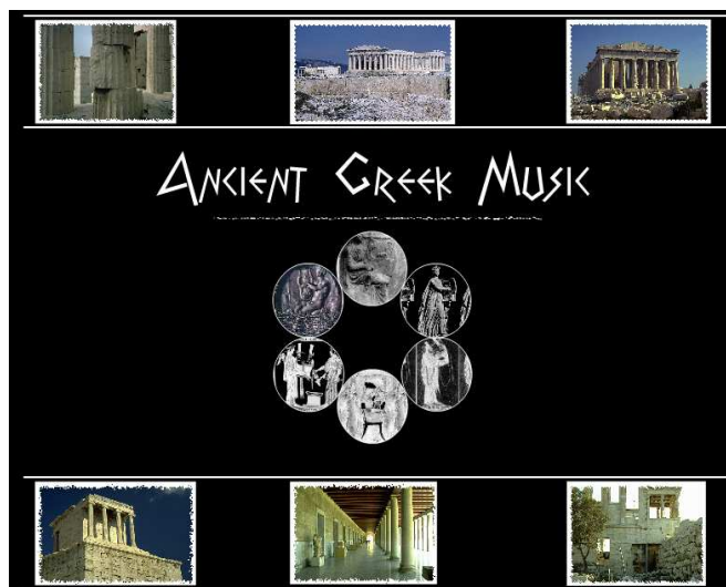
Fig. 2. The graphical User Interface of ORPHEUS.

The central user interface of ORPHEUS is presented in Fig. 2. The music track that can be listened to during the introduction of the presentation has been exclusively written for the application and is about a musical composition with contemporary hearings, which is influenced from AGM in many ways (melody, instruments, modes, rhythm.)